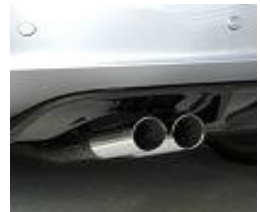
Double exhaust pipes