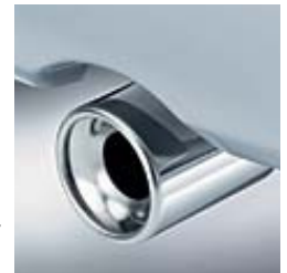
Single exhaust pipes