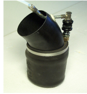
Nozzle with Hose connector