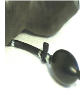
Nozzle with Hand pump